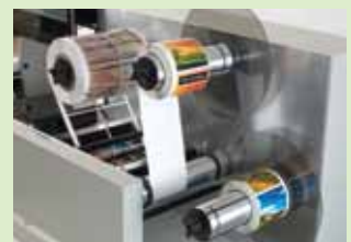
Rewinding to finished rolls