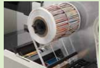
Waste matrix removal